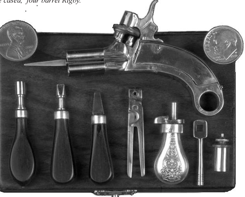
Above: Shown actual size is the four barrel Rigby with accessories

The autor is engraving the body and hammers of the guns, shown in this article, with foliation and scrolls and inscribed on reverse in a ribbon W.& J RIGBY and on obverse DUBLIN, with very deep engraving typical of the Rigby workmanship.